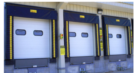
Dock Seals & Dock Shelters

Pentalift manufactures a complete range of foam and air inflatable dock seals as well as rigid, flexible and air inflatable dock shelters. All products are designed to improve safety, protect merchandise, reduce cost and improve security at the loading dock. The wide range of fabric materials, configurations, and options allow you to build the best solution for your application.